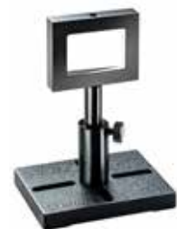
Optional large wedge beam splitter (SPZ17018)

Shown is an image of a laser with beam diameter of 13mm. As can be seen, it is easily seen with the SP920s, SP932U camera with the 4X beam reducer.