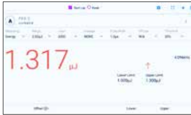
Pass/Fail screen. Excellent for QA purposes.