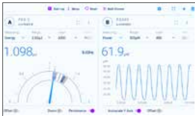
Two independent channels of measurement.