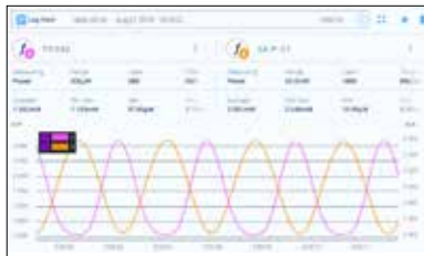
Two channels merging into one graph.