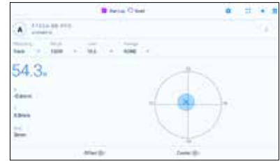
Power, Position, and Size measured with a BeamTrack sensor.