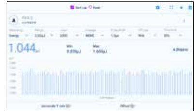
Pulse chart display of energy.