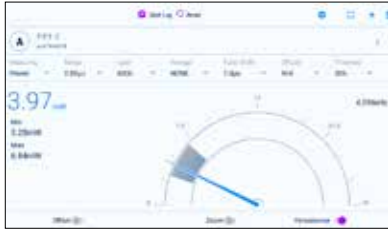
Analog needle display of power Persistence and min/max tracking.