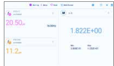
Two channels with a math comparison channel.