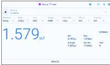
Display statistics of the present measurement session.